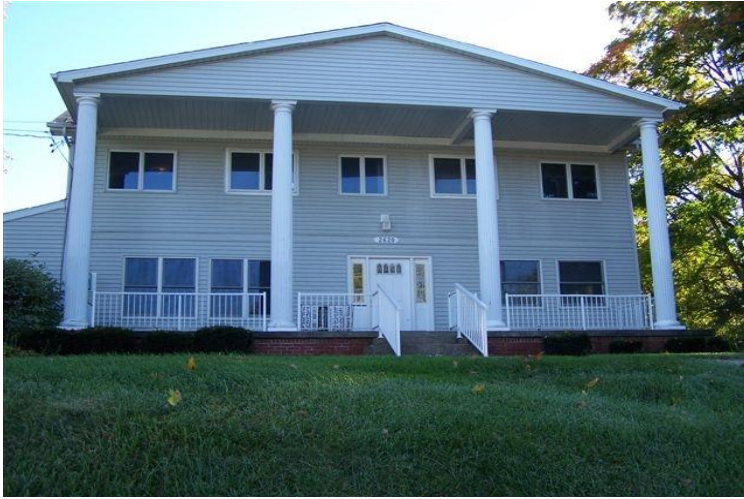
Contract Residence Eagle Star Emergency Housing 16-male bed facility